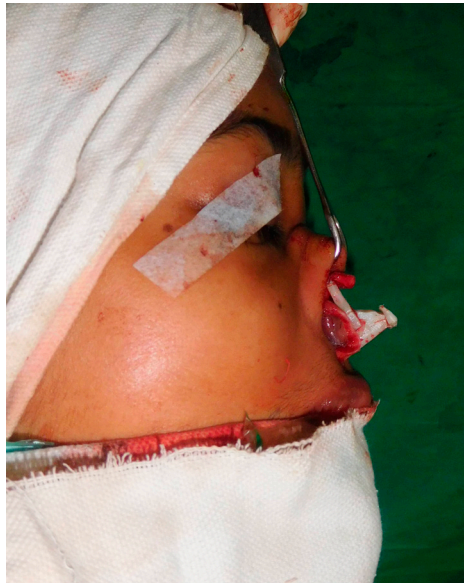
Figure 3. Picture in lateral view. Once the required columella labial angle is set, the tent pole graft is sutured to the dorsum to fix it