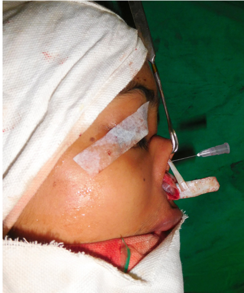
Figure 1. Picture in lateral view of a patient who underwent rhinoplasty, showing temporary fixation of the tent pole graft to set the columella labial angle using needle