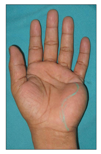
Figure 1: Diffuse swelling in the hypothenar area

The possibility of nerve injury should always be discussed with the patient preoperatively. Extreme caution should