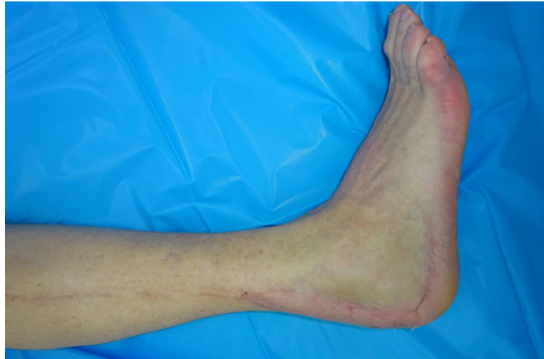
Figure 5. Lateral aspect of the lower leg and foot 6 months after reconstruction with the distally based peroneus brevis muscle flap and split-thickness skin graft. The distal part of the flap needed secondary skin re-grafting and hence healed uneventfully

were completely healed without any evidence of instable scars, chronic infections or fistulae. Patients reported a high level of satisfaction regarding the outcome of surgery without any significant statistical difference between the compared flaps. The active total range of motion was comparable in both groups without significant differences [extension/flexion 78.5\% \pm 20.0\% (PBF peroneus flap), 66.6\% \pm 23.1\% (DSF distal sural flap) and pronation/supination 70.9\% \pm 27.7\% (PBF), 61.1\% \pm 33.3\% (DSF)]. No instability of the ankle joint was observed in patients from both groups. Circumference of the lower leg 15 cm below the knee joint and above the ankle joint was comparable in both groups. No significant postoperative lymphedema was observed. Hypaesthesia in the lower leg or foot region, except for the flap itself and the skin-grafted regions at the donor site, was reported by 21% of patients from the PBF and 58% of patients from the DSF group [36] . Patients did not report significant functional impairment due to these hypoaesthetic zones. Neuromas were neither observed at the donor nor at the recipient sites in this series [36] .