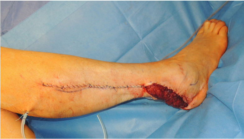
Figure 3. Primary closure of donor site with distally based peroneus brevis muscle flap sutured into place before skin grafting