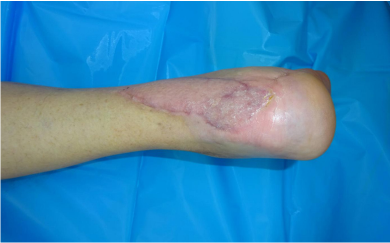
Figure 4. Dorsal aspect of the reconstructed heel region 6 months after surgical therapy