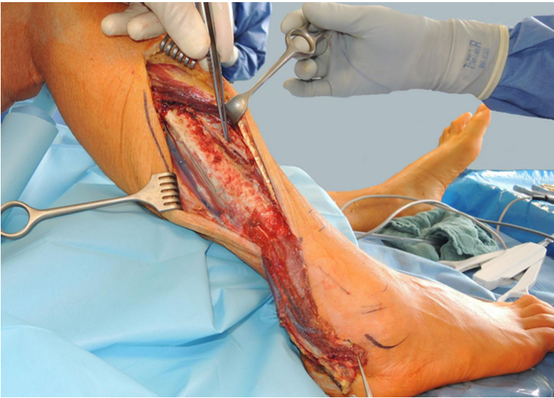
Figure 2. The 75-year-old patient with intraoperative raised distally based peroneus brevis muscle with flap turned and flipped over to 180 degrees into defect zone of a chronic wound after open reduction and internal fixation of calcaneal fracture