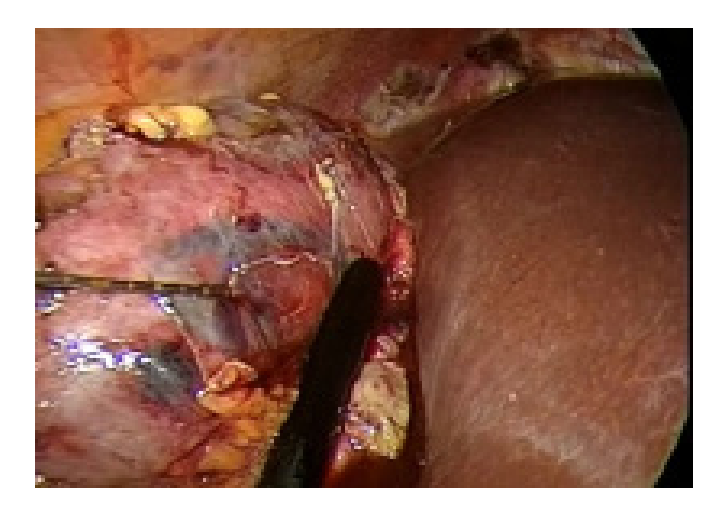
Figure 4. Under ultrasound evaluation the needle is carefully removed