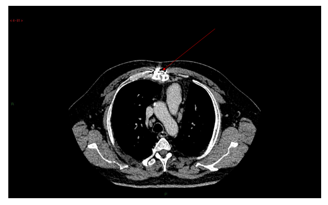
Figure 2: Computed tomography scan of thorax showing nonunion of sternum (red arrow - sternal malunion)

his sternum when turning in bed. There were no discharging sinuses as the skin had healed well. All other examination findings were normal.