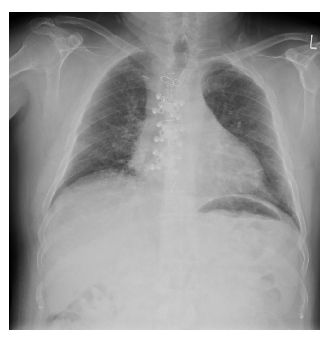
Figure 3: Postoperative chest X-ray showing union and fixation of sternum with titanium sternal fixation system

Critics of BITA however highlight its limitation with the theoretical increased risk of sternal wound infections due to the devascularisation of the sternum. Grossi et al. <sup>[7]</sup>