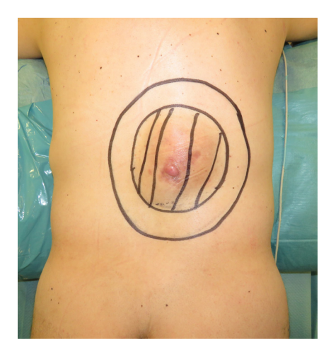
Figure 1. A 48-year-old man with a dermatofibrosarcoma protuberans measuring 16 cm × 14 cm × 6 cm was present on the mid back