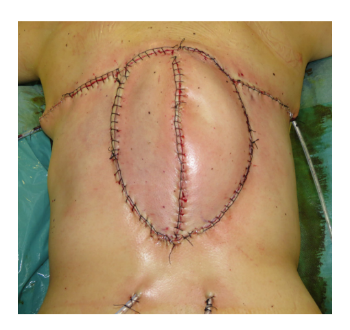
Figure 6. Immediate postoperative result