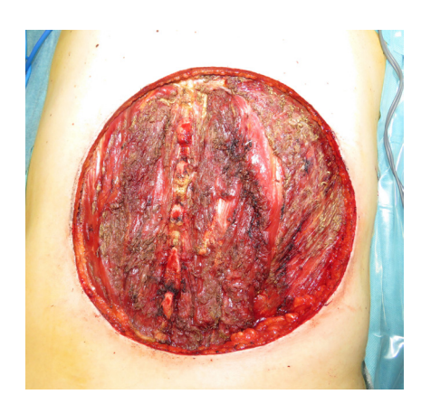
\textbf{Figure 4.} \ \ \text{Wound defect after wide local excision of dermatofibrosarcoma protuberans that measured 22 cm} \times 20 \ \text{cm} \ \text{in diameter}

muscle, and the flaps were harvested between the latissimus dorsi and the serratus anterior muscles. The thoracodorsal neurovascular bundle was identified, ligated and divided with preservation of the vessels and nerve distributing to the serratus anterior muscle. The myocutaneous flaps were freed from the underlying chest wall along the superior and lower borders of the muscle, preserving dorsal intercostal perforating vessels. When the harvesting was close to the paraspinous region, multiple paraspinal perforators of the posterior intercostal arteries could be seen entering the deep surface of the muscle. We based the two flaps on the 9th and 10th intercostals perforators, in order to allow flap transfer without restriction. The two flaps were transposed to the defect and sutured together [Figures 5 and 6]. The donor sites were closed directly. Four drain tubes were placed (2 for the flap donor sites and 2 for the lumbar region).