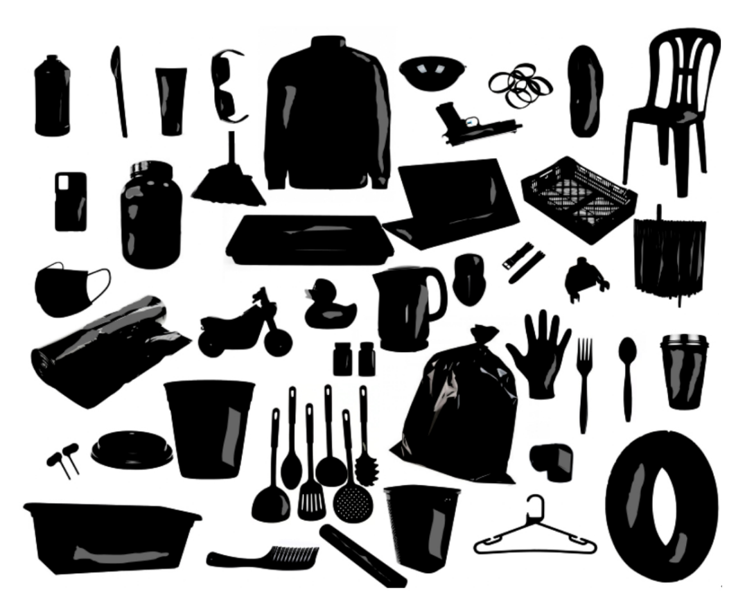
Figure 1. Examples of black plastic products.

Notes: No study reported the polymer composition of the isolated black microplastics. Data from different sampling sites in a study are presented separately. For example, data in rows 1 and 2 are from the same study (i.e., article #1).