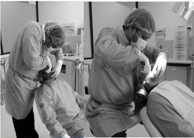
Figure 2: Diminished visibility and accessibility during extraction of mandibular right posterior teeth from right rear position

position provides a more balanced posture with increased visibility and accessibility to the oral cavity when extracting the mandibular right second and third molars.