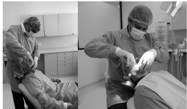
Figure 3: The most compatible operator position for mandibular right posterior teeth extraction