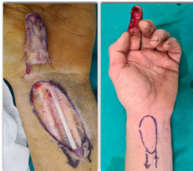
Figure 1. Venous free flap for volar index soft tissue loss.