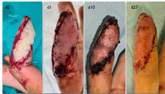
Figure 2. Evolution of venous flap postoperatively, day 1, day 10, and end of 3rd week.