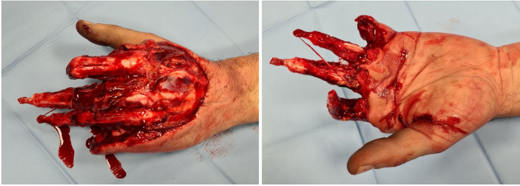
Figure 4. Degloving hand trauma