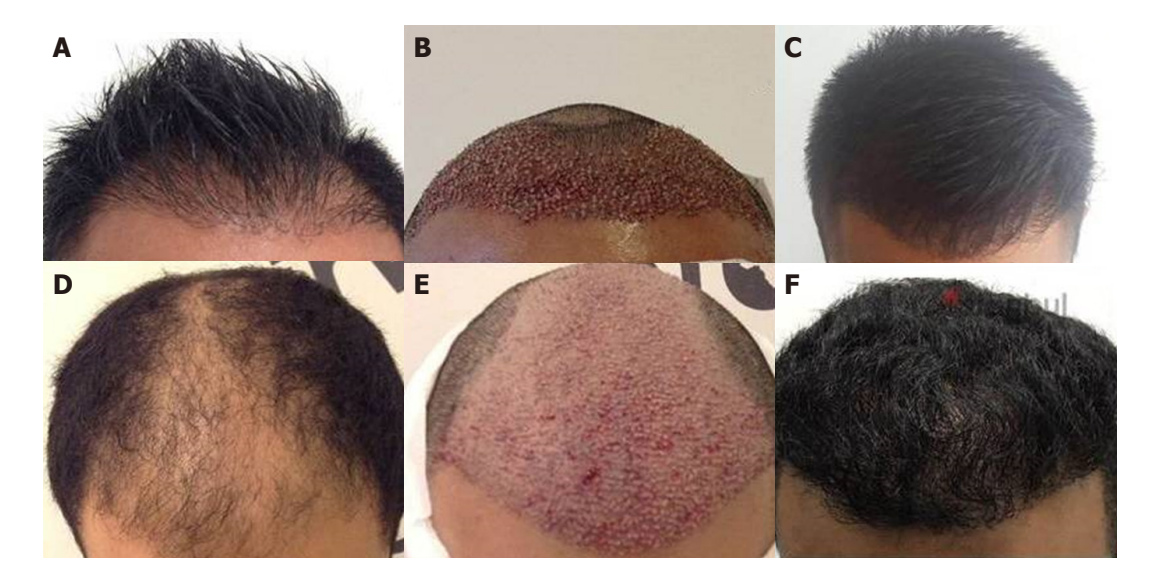
Figure 3. (A-C) A 32-year-old male patient with Norwood type III patient. (A) Preoperative appearance; (B) immediate appearance of the patient after transplantation; (C) postoperative 1-year appearance. (D-F) A 38-year-old with Norwood type V patient. (D) Preoperative appearance; (E) immediate appearance of the patient after transplantation; (F) postoperative 1-year appearance

growth<sup>[12]</sup>. Mesotherapy and platelet-rich plasma can be utilized in patients needing additional therapies in the enhancement of hair growth. Mesotherapy consists of superficial injections of pharmaceuticals and vitamin compounds to the follicles. Platelet-rich plasma (PRP) is used in almost every section of the medicine and includes several platelet-derived factors<sup>[13]</sup>. It is proven that PRP injections enhance hair growth in transplanted follicles<sup>[14-16]</sup>. Nevertheless, more studies are needed to evaluate PRP as a hair loss therapy.