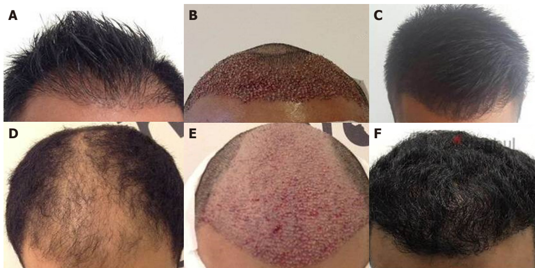
Figure 3. (A-C) A 32-year-old male patient with Norwood type III patient. (A) Preoperative appearance; (B) immediate appearance of the patient after transplantation; (C) postoperative 1-year appearance. (D-F) A 38-year-old with Norwood type V patient. (D) Preoperative appearance; (E) immediate appearance of the patient after transplantation; (F) postoperative 1-year appearance

growth [12] . Mesotherapy and platelet-rich plasma can be utilized in patients needing additional therapies in the enhancement of hair growth. Mesotherapy consists of superficial injections of pharmaceuticals and vitamin compounds to the follicles. Platelet-rich plasma (PRP) is used in almost every section of the medicine and includes several platelet-derived factors [13] . It is proven that PRP injections enhance hair growth in transplanted follicles [14-16] . Nevertheless, more studies are needed to evaluate PRP as a hair loss therapy.