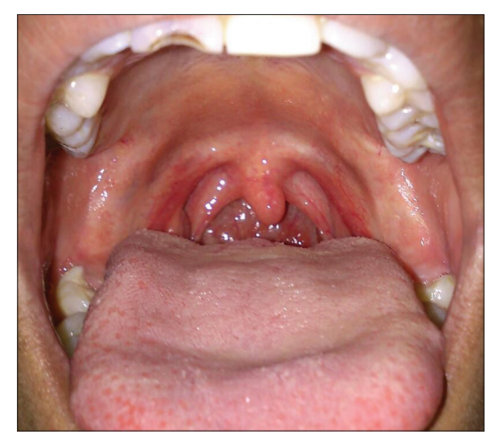
Figure 3: Uvula is central and palatal archs are bilaterally symmetrical on the 7th day after admission

varying degrees of dysphagia, and commonly mimics brainstem lesions.