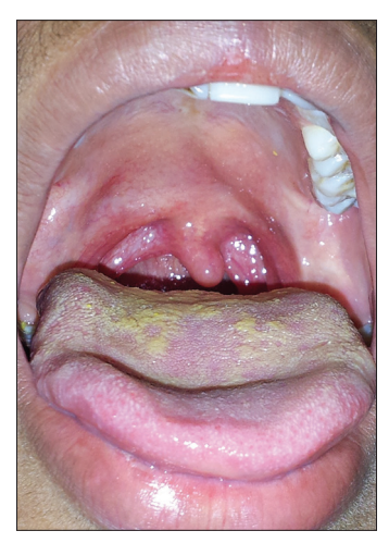
Figure 1: Uvula is deviated to the left side on admission