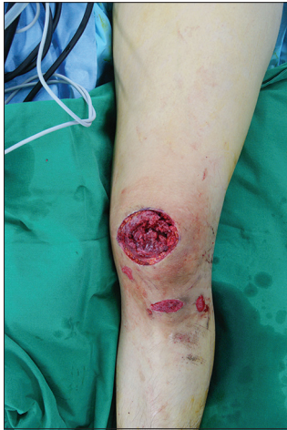
Figure 1: Preoperative finding shows soft tissue defect of the left knee measuring 12 cm × 7 cm with patella exposure