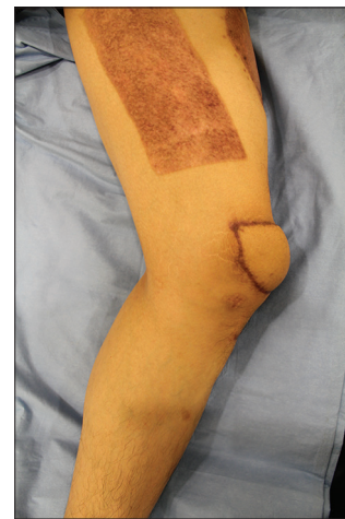
Figure 4: Acceptable functional and aesthetic appearance was obtained at postoperative month 11

musculocutaneous flap was excluded to avoid unreliable vascularity of the donor site. Instead, a free flap reconstruction using a vessel in the vicinity of the knee as the recipient was planned.