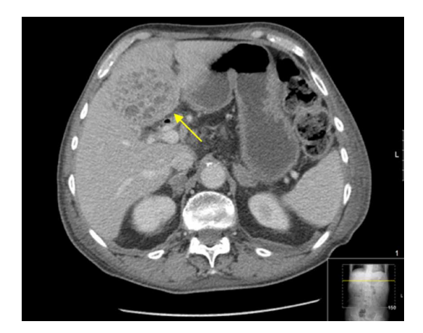
Figure 2. Computed tomography scan performed when the patient was admitted for cholangitis. A liver abscess (yellow arrow) was diagnosed. It was later percutaneously drained and E. coli was identified

2016 the patient complained of right hypochondrial pain, nausea and vomiting, generalized pruritus and fever. Abdominal ultrasound revealed evident de novo hepatic lesions and elevation of acute inflammatory parameters. The patient was admitted for cholangitis and started on antibiotics and supportive therapy. A CT scan identified an intrahepatic abscess which was drained percutaneously [Figure 2]. A Gram-negative bacterium, Escherichia coli , was identified in blood cultures as well as in the drained pus and the patient was discharged after full recovery.