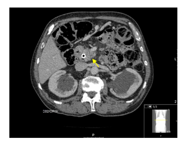
Figure 1. Computed tomography scan at diagnosis (2013). Shown is the pancreatic mass (25.3 mm, yellow arrow), a histologically proven pancreatic adenocarcinoma. A metal stent was placed to relieve symptoms such as jaundice

meeting surgical criteria - the only treatment offering the potential for a cure<sup>[3,4]</sup>. Alternatively, the patients may be candidates for systemic palliative treatment, if clinically compatible, or best supportive care. In general, the estimated 5-year survival is 5%<sup>[4]</sup>. More than 85% of all solid pancreatic neoplasms are ductal adenocarcinoma<sup>[3]</sup>. On the other hand, pancreatic neuroendocrine tumors are considered rare<sup>[5]</sup>, although with a reported increase in incidence in the last decades<sup>[6]</sup>. Although little is known about the epidemiology of metastization in this disease, the liver is the preferential site metastatic disease<sup>[7]</sup> and treatment algorithms are available<sup>[8]</sup>. The authors present a case of a long-term survivor with an unresectable pancreatic adenocarcinoma, stage III with a later diagnosis of liver metastasis of pancreatic neuroendocrine origin.