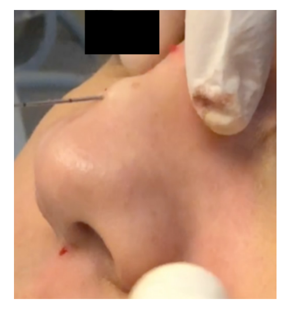
Figure 5. Treatment of the rhinion following treatment of the radix