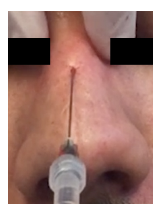
Figure 2. 22-gauge microcannula insertion through the injection site

Understanding the anatomy of the nose is critical to minimizing the risk of complications and optimizing the aesthetic outcome. From superficial to deep, the four layers that comprise the nose are the superficial fatty layer, the SMAS (superficial musculo-aponeurotic system), the deep fatty layer, and periosteum<sup>[14]</sup>. The superficial fatty and SMAS layers contain major blood vessels of the nose. To minimize and avoid vascular occlusion, skin necrosis, and blindness, filler injections should be delivered into the deep fatty layer, which is between the SMAS and the periosteum. In regards to the dorsal nasal artery, it is imperative that the injector verifies that the tip of the cannula is in the preperiosteal plane. This helps to avoid accidental arterial cannulation which can often lead to serious ocular complications<sup>[15]</sup>.