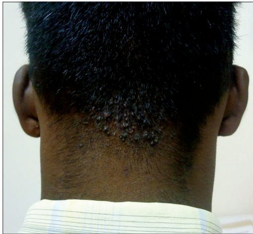
Figure 1: Acne keloidalis nuchae of the occipital scalp after failed CO 2 laser treatment and topical steroid and intralesional steroid injection

size of 7 mm. A second treatment sitting with the above settings was repeated after 3 weeks, using the same laser applications on each side of the scalp as in the first treatment. Twelve days after the second sitting, there was complete resolution of the lesions with no residual scarring [Figure 3]. He was kept on observation for any