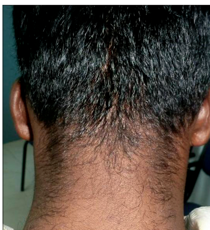
Figure 3: Post-Nd:YAG and -diode laser therapy; the lesion shows good resolution

recurrence. The patient was advised to avoid shaving the posterior part of the hairline close to the skin and to avoid wearing clothes that rub or irritate the posterior parts of the scalp and the neck. There was no recurrence of the lesion seen at 15 months follow-up.