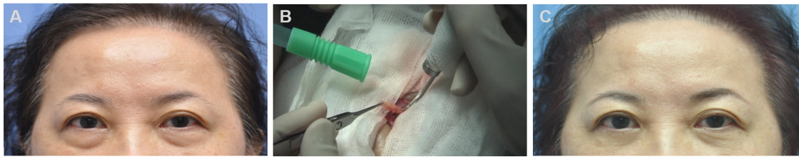
Figure 3. A 57-year-old woman underwent CO 2 laser transconjunctival lower blepharoplasty followed by Fraxel laser resurfacing: before operation (A); orbital fat was removed using CO 2 laser followed by Fraxel laser resurfacing (B); and 6 months after operation (C).

Laser administration nonetheless can have disadvantages. High costs, technical challenges, and safety hazards are the most apparent. Incisional procedures using the CO 2 lasers can be technically challenging [22,23] . Although laser blepharoplasty is gaining acceptance rapidly by patients and surgeons alike, the superiority of this technique over cold steel has not been unequivocally established or disproved. Before transconjunctival blepharoplasty of the lower lid, the laser is tested on a tongue blade held over a nonflammable surface away from the patient to ensure the beam is under proper parameters. After the incision, the laser is defocused and used to coagulate any blood vessels larger than 0.5 mm that did not coagulate during the initial incision. Fat should not be excised by pulling or forceful distraction as this will tear the vessels and result in bleeding complications and fat over-resection, which produces a cadaveric appearance in the patient. Fat should be resected using gentle pressure on the globe until the fat flushes to the orbital rim but not beyond. During orbital fat removal, it is essential to note that the inferior oblique and inferior rectus muscles can be injured.