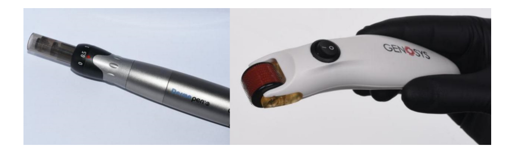
Figure 2. Dermapen and dermaroller.

results achieved are more dramatic and short term.