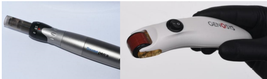
Figure 2. Dermapen and dermaroller.

results achieved are more dramatic and short term.