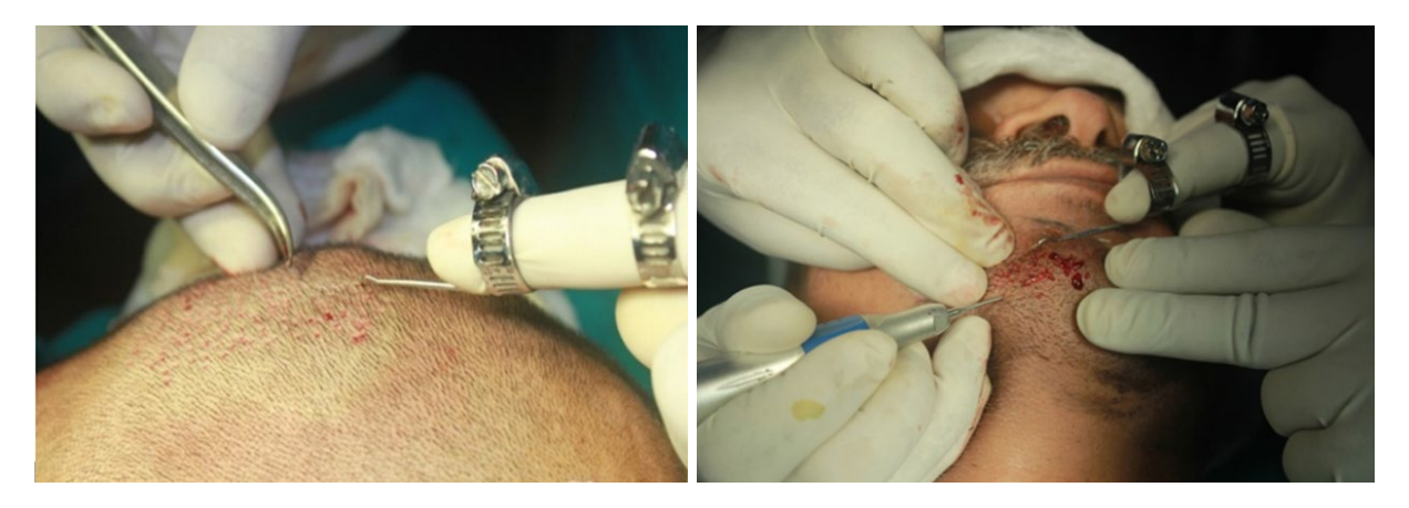
Figure 3. Skin stretching during removal of graft (left) and during beard follicular unit extraction (right)