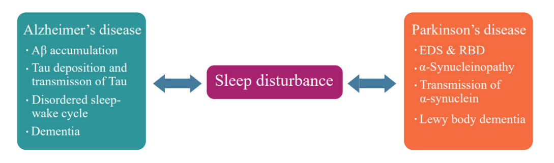
Figure 1. Interactions between sleep disturbance and neurodegenerative diseases. Sleep disturbance plays roles in neurodegenerative disease. It promotes the pathogenesis of Alzheimer's disease (AD) and Parkinson's disease (PD). Sleep disturbance is tightly associated with A \beta and tau deposition in AD and \alpha -syn accumulation in PD. It also promotes the transmission of disease proteins, such as tau in AD and \alpha -syn in PD. Furthermore, sleep disturbance is positively related to dementia in AD and excessive daytime somnolence (EDS) and rapid eye movement sleep behavior disorder (RBD) in PD. However, there are bidirectional relationships between sleep disturbance and neurodegenerative diseases. Neurodegeneration and pathogenesis in neurodegenerative diseases induce sleep disturbance, further leading to deterioration of the disease. A \beta : Amyloid- \beta ; \alpha -syn: \alpha -synuclein.

conversion from idiopathic RBD to PD is extremely high. RBD is associated not only with the development of PD but also with a risk for dementia<sup>[20]</sup>. Importantly, among the sleep disorders in PD, RBD is mostly associated with the development of PD pathology. In an observational cohort study, patients with idiopathic RBD were followed up for 7 years and examined with dopamine transport imaging, transcranial sonography and olfactory testing<sup>[35]</sup>. With this cohort, 82% of patients with idiopathic RBD show neurodegenerative syndrome with an increased risk for developing PD and Lewy body dementia. In three patients with antemortem diagnosis of PD and Lewy body dementia, there were widespread Lewy bodies in the brains and \alpha -syn aggregates in the peripheral autonomic nervous system, suggesting an association between RBD and synucleinopathy<sup>[35]</sup>. Interestingly, these three patients show Lewy pathology as well as a loss of neurons in the brainstem nuclei that regulate REM sleep atonia<sup>[55]</sup>, which may also reflect a connection between synucleinopathy and REM sleep without atonia in PD.