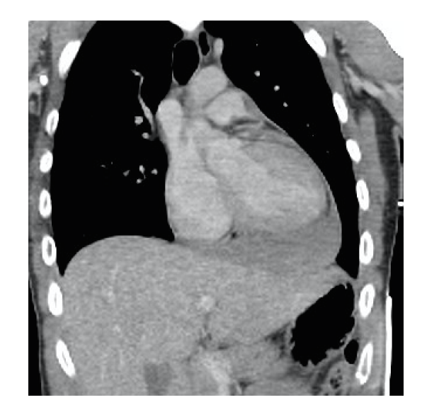
Figure 1. Preoperative CT scan of thorax and abdomen. Coronal view showing a localized collection in the inferior/posterior pericardial walls

cannulation and mild hypothermia was established. Myocardial protection was achieved with intermittent antegrade cardioplegia.