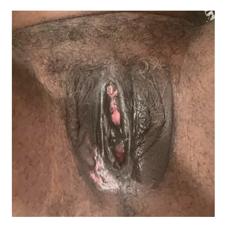
Figure 2. Patient external genitalia three months status post primary intestinal vaginoplasty. Posteriorly based flap, with the aim to prevent a cicatricial scar at the introitus, is well healed.

depends upon the vascular supply and length of the intestine required. The intestinal segment may be evaluated with indocyanine green (ICG) fluorescence to ensure adequate perfusion. A stapled colorectal anastomosis is performed to restore intestinal continuity. If necessary, a Pfannenstiel incision may be made to assist with the passage of the intestinal segment into position in the perineum. The proximal portion of the sigmoid is fixed to the presacral fascia [Figure 2].