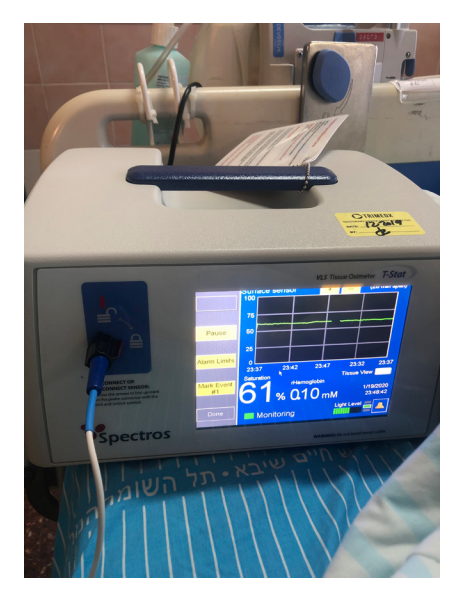
Figure 8. We use the T-Stat<sup>™</sup> VLS Tissue Oximeter (Spectros; Portola Valley, CA) for postoperative flap monitoring in all patients, and sometimes for intraoperative decision-making. It provides continuous quantitative measurements of total hemoglobin concentration [Hgb] and hemoglobin oxygen saturation