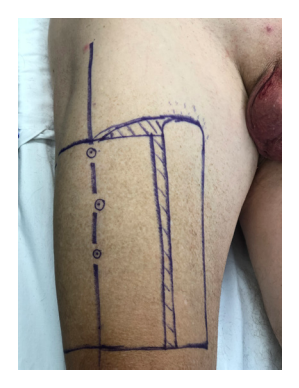
Figure 6. Preoperative marking of an anterolateral thigh flap donor site showing (1) as short-as-possible urethral extension; (2) deepithelialization of the proximolateral dermis next to the urethral extension; (3) sparing of the fat around the urethral extension. Circled dots represent the location of three flap perforators identified with a handheld Doppler

(3) The vascularity of an ALT flap relies on the patient's anatomy, specifically the perforators arising from the descending branch of the lateral circumflex femoral artery<sup>[3,9]</sup>. It is advantageous to include the largest and as many perforators as possible when designing this particularly large flap<sup>[9]</sup>. When using the ALT flap, we use a handheld Doppler to mark the patient's dominant perforators while the patient is awake in the preoperative holding area. An example of particularly small ALT perforators is shown in Figure 5.