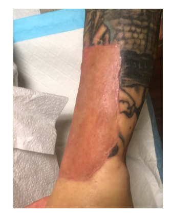
Figure 7. Six-week postoperative appearance of radial forearm flap donor site covered with thin Integra®, 18/1000-inch thick split thickness skin graft, and negative pressure wound therapy for 8 days. Note excellent take of the skin graft, minimal step-off, and plump, nonadherent configuration of the graft

However, using an STSG alone can be associated with significant donor site morbidity<sup>[11,18]</sup>. STSGs may adhere to the exposed tendons and reduce the strength and range of motion, lead to contractures, and is frequently distressing to the patient<sup>[13,18]</sup>.