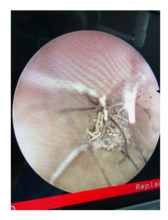
Figure 2. Cystoscopic appearance of abundant hair in the proximal penile urethra, which became calcified by urinary solutes and created an obstructive intraurethral trichobezoar/hairball