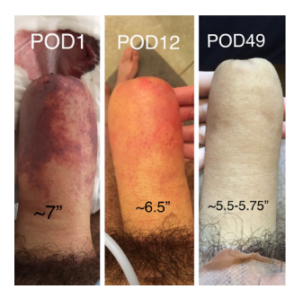
Figure 3. Comparison of penile girth after liposuction by postoperative day (POD), showing a 20% decrease in girth over time. Of note, there is prominent ecchymosis and swelling immediately after the procedure, which subsides with time

Figure 2. Cystoscopic appearance of abundant hair in the proximal penile urethra, which became calcified by urinary solutes and created an obstructive intraurethral trichobezoar/hairball