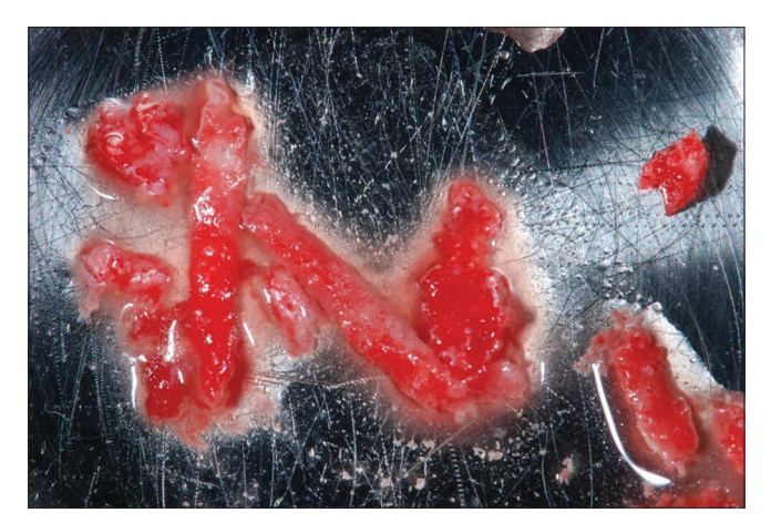
Figure 2: A harvested particulate autologous bone graft