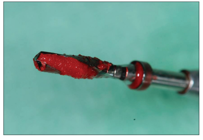
Figure 1: Particulate bone graft is harvested from the drill

Histological evaluation of the samples with an optical microscope showed that, even in a particulate state, the bone structure was well-preserved [Figures 3 and 4], containing a large number of osteocytes within the