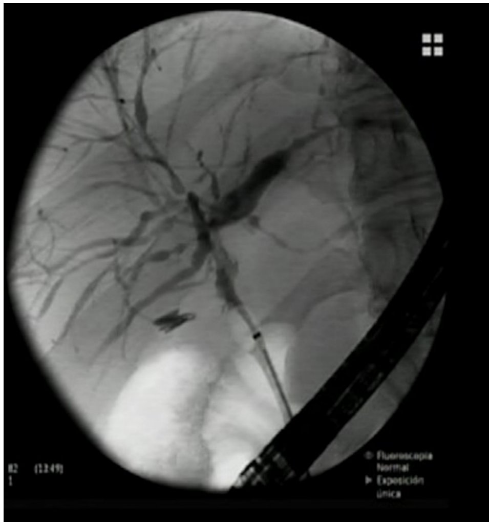
Figure 2. A 58 year-old man with long lasting primary sclerosing cholangitis and ulcerative cholangitis. A stenosis in the hepatic duct associated with focal bile duct thickening with enhancement at MRI was detected. A diagnostic ERCP was performed, confirming the presence of a noncritical stenosis of 2.5 mm in diameter and 5 mm in length in the hepatic duct, just below the hepatic confluent. Brush cytology and biopsy were obtained for anatomopathological analysis, and no atypia were found.

cholangioscopy was a highly accurate diagnostic modality for CCA diagnosis with a pooled sensitivity and specificity of 65% (95%CI: 35%-87%) and 97% (95%CI: 87%-99%), respectively [46] . It should state that a negative biopsy does not exclude CCA owing to the possibility of sampling error.