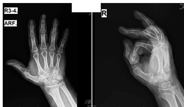
Figure 6. Six months after the olecranon bone grafting, the bony healing was complete

in nonunion in the 3rd finger, as confirmed by x-rays taken in the 6th week [Figure 3]. At 7 weeks after the first operation, an arthrodesis with an olecranon graft was performed on the 3rd distal interphalangeal joint [Figure 4]. The thickness and stability of the nail bed were suitable, so grafting was performed through the incision in the middle of the nail bed [Figure 5]. Six months after the olecranon bone grafting, the bony healing was complete [Figure 6].