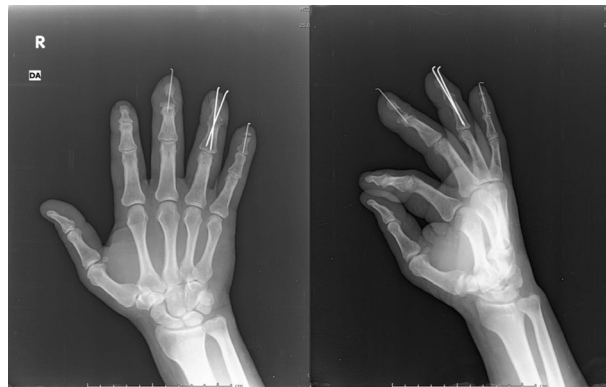
Figure 3. Segmental bone defect can be seen in the distal phalanx of the third finger