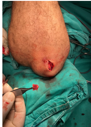
Figure 1. A 3 cm incision for bone graft harvesting was made starting 1-1.5 cm distal to the tip of the olecranon