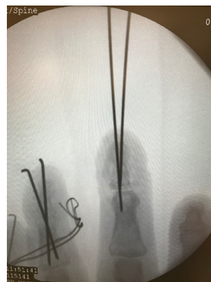
Figure 4. At 7 weeks after the first operation, an arthrodesis with an olecranon graft was performed on the 3rd distal interphalangeal joint