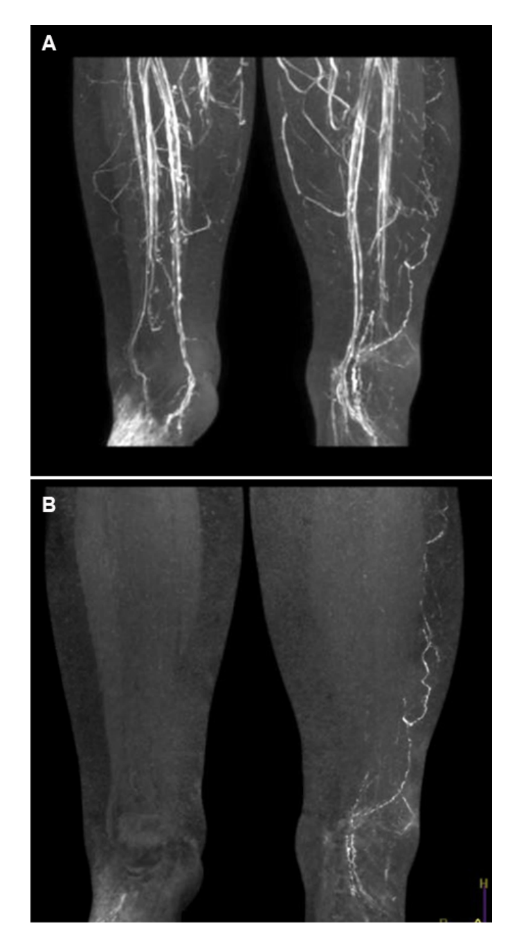
Figure 5. (A) MR Lymphangiogram of a patient with lymphedema of the left leg. Note the difficulty of identifying veins and lymphatics. (B) The same patient with Feraheme producing a "dark blood" image clearly showing lymphatic channels and no veins.

In this way, a treatment plan can be formulated, and as already mentioned, the modalities listed above may be used to assess the patient's progress on an ongoing basis. Finally, to show the practical application of these assessments, my algorithm for managing the lymphedema patient is presented [Figure 6] in this algorithm, which is used for either primary or secondary lymphedema, all patients who can receive an MR Lymphangiogram. If for some reason, they cannot have an MR, then fluorescent lymphangiography is performed with ICG. If no lymphatic channels are seen, patients are divided into those who have had a previous lymph node dissection and those who have not. The latter group represents primary cases. In either case, the only treatment offered is excisional, the commonest of which is liposuction. The exception is