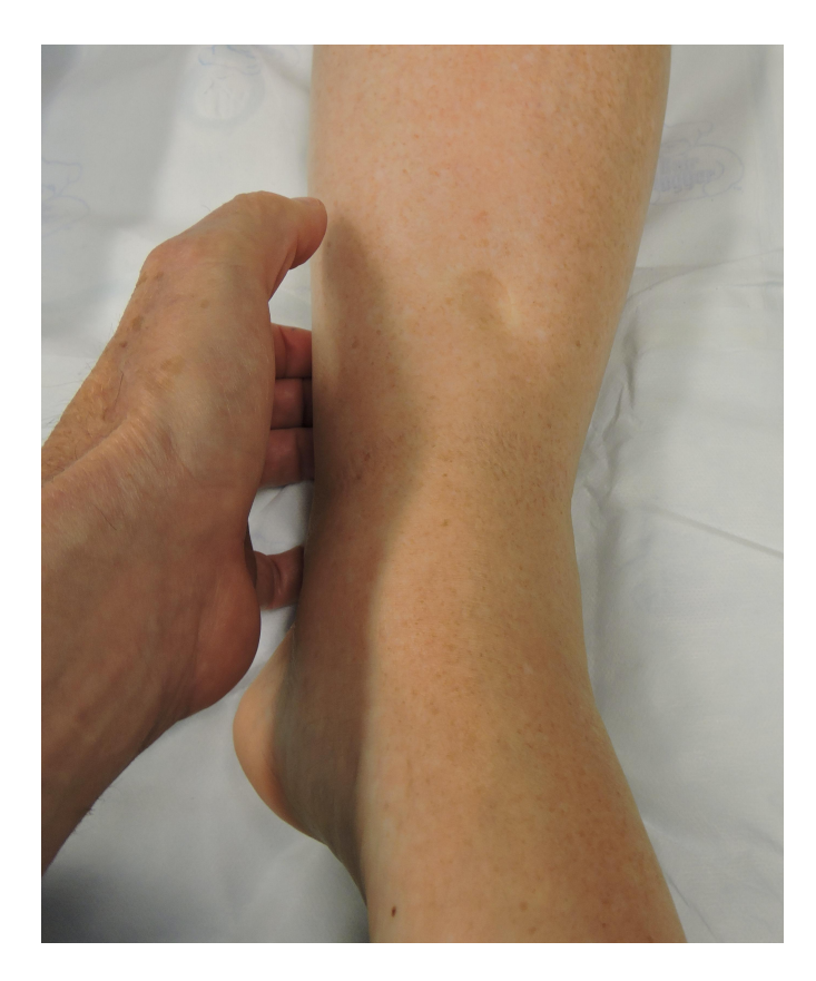
Figure 2. Pitting edema is elicited by firmly pressing on the limb with the thumb for 1 min. Here we see the imprint of the thumb indicating fluid in the tissues. As lymphedema progresses, pitting edema is less prevalent because of the accumulation of fibro-adipose tissue.

lymphatics and increasing sclerosis. Apart from its use as a diagnostic tool, ICG is important for mapping the lymphatics at the time of surgery so that incisions can be planned accurately<sup>[7,8]</sup>.