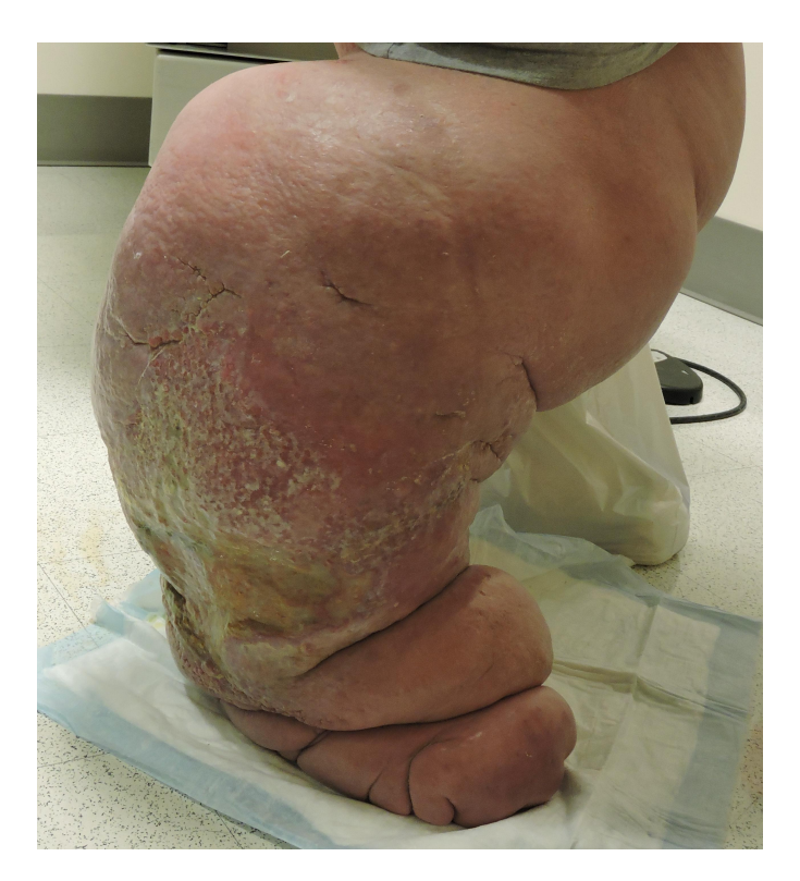
Figure 1. This patient with extreme late-stage lymphedema shows trophic skin changes. There are folds of edematous skin and thick rigorous skin, giving rise to fissures and increasing the risk of infection.

In lymphedema, tissue impedance decreases, which is a useful test that can be used for initial assessment and to measure the patient's response to treatment<sup>[5]</sup>. However, it may be misleading in early or pre-clinical lymphedema, where the bio-impedence may be normal. Therefore, it is most useful as a trend measurement over time.