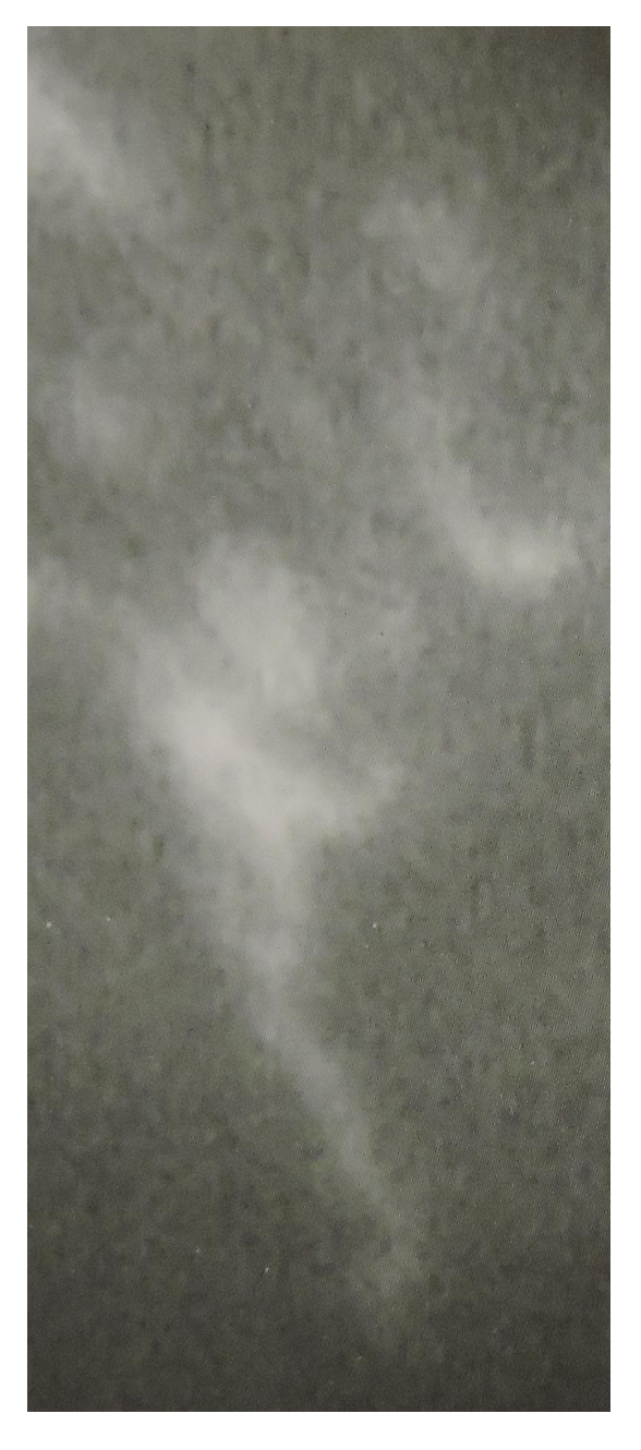
Figure 4. This is the splash pattern seen with ICG lymphangiography in early lymphedema. The lymph is mainly contained within lymphatic channels, but a "splash" of ICG is also seen in the soft tissues. ICG: Indocyanine green.