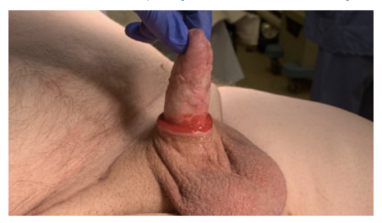
Figure 6. Chronic wound at the proximal aspect of the graft, where it was anastomosed to the native skin at the base of the penis. Must have penis on maximum stretch in supine position just to see entire graft and wound