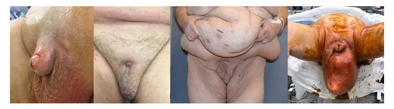
Figure 1. The condition of adult-acquired buried penis presents on a spectrum of severity

treatment for this condition. Early series describing surgical approaches in the management of AABP involved a relatively long procedure with prolonged postoperative bed rest and lengthy hospital stays<sup>[2-4]</sup>. "Success" of an operation was predominantly defined by surgeon-specific objective measures of success, while patient-related quality of life measures were not considered until more recently<sup>[5-7]</sup>. Much like many other operations in the field of urology ( e.g. , transurethral resection of the prostate, radical prostatectomy, and urethroplasty), the surgical approach to AABP has undergone a rapid evolution to minimize morbidity and expedite discharge from the hospital. However, some variation in treatment and postoperative care still exists. The purpose of this article is to describe the maturation of surgical approaches for this condition, describe our enhanced recovery after surgery (ERAS)-inspired approach for postoperative care, and make a plea for improved collaboration amongst surgeons to reduce the variability in care for this population.