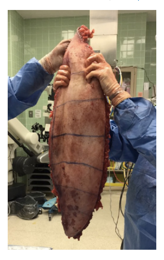
Figure 8. Large specimen of escutcheon adipose tissue. Skin can be harvested for penile skin grafting if needed