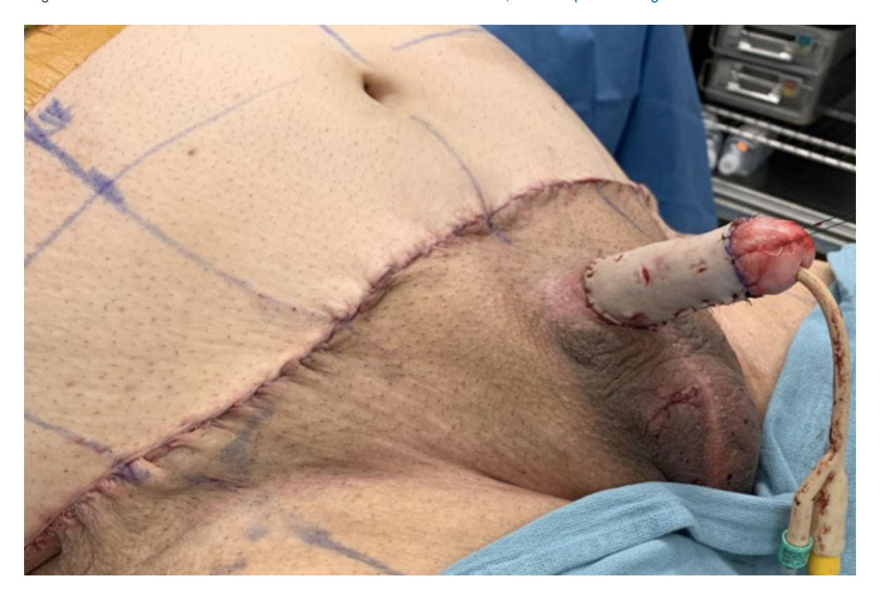
Figure 5. Skin bridge at the base of the penis that can be tacked upwards to the superior skin flap to help reduce the possibility of divot formation by having an anastomosis at the base of the penis

the base of the penis [Figures 3 and 4]. This tends to occur when the skin graft is sutured in place with the penis on maximum stretch. The misconception is that grafting a stretched penis will result in improved unburied length post-operatively. On the contrary, this can lead to wound issues postoperatively due to retraction of the proximal graft into the surrounding skin, resulting in a persistently moist environment similar to that in the preoperative state [Figure 6].