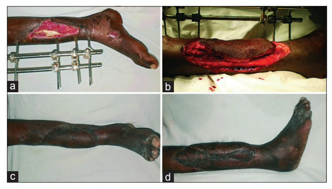
Figure 3: (a) Posttraumatic defect in the lower leg with exposed and fractured tibia, (b) flap elevated from the lateral aspect of the lower leg. (c) two months postoperative view. The external fixator has been removed. (d) well settled skin graft on the lateral aspect of the lower leg

the flap are assumed to be present. The advancement obtained by skin incision and limited elevation has been questioned.<sup>[5]</sup> In the classical perforator concept, the emphasis is on dissecting perforators and not on design of the skin island. In the leg, where there is relatively no lax skin, these two concepts can be amalgamated with success.