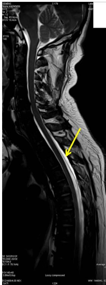
Figure 2: T2 sagittal sequence from the spine MRI showing elliptical high signal extra axial collection posterior to the spinal cord at T3 to T8 level (as marked by the arrow, suggestive of CSF leak)