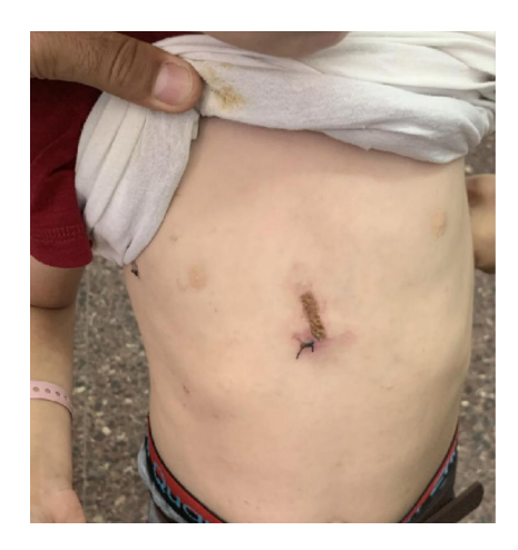
Figure 4. The subxiphoid wound, one week after surgery