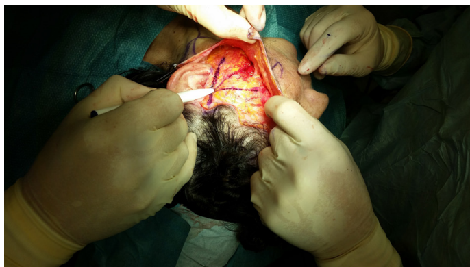
Figure 3. Superficial musculoaponeurotic system

edema, as well as minimal postoperative bruising. This technique produces effective results, supports a volume of midface without causing injury to the facial nerve. This study showed a new, safe approach to facial rejuvenation combining the elements of the SMAS placenta with a blepharoplasty to achieve long-term improvement of middle-aged aging and a more natural effect. The low incidence of morbidity was accompanied by rapid convalescence and most patients were able to return to work and social activities very early with