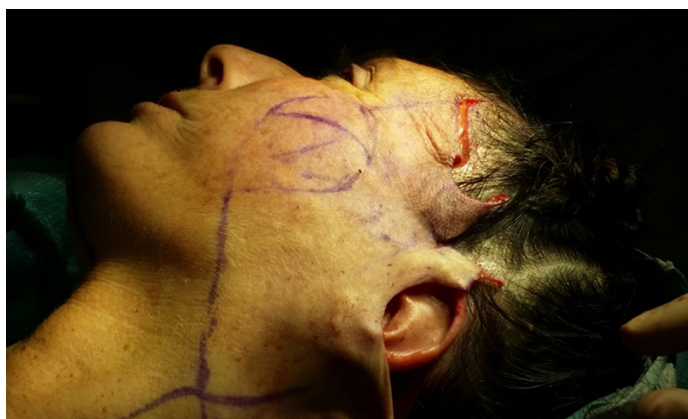
Figure 6. Cut of the skin flaps on the delimited line