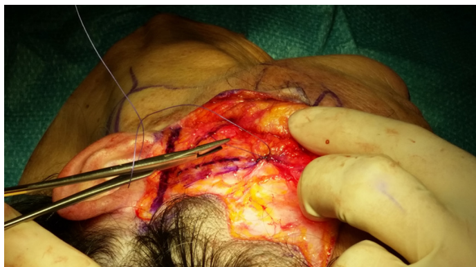
Figure 4. Emplicature superficial musculoaponeurotic system