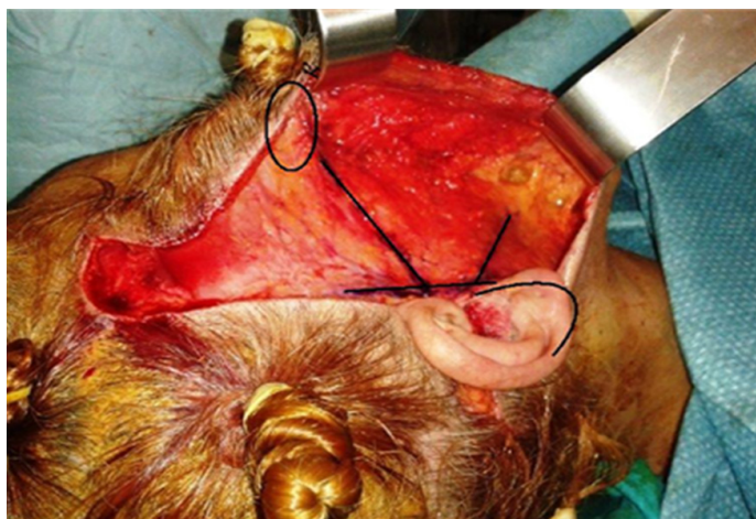
Figure 2. Traction points