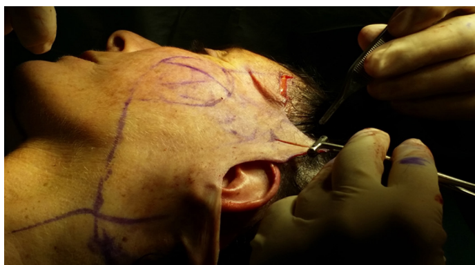
Figure 5. Cute positioning for sutures