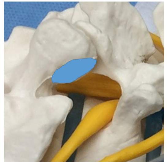
Figure 2: Partial fecetectomy to widen transforaminal space. An area of partial fecetectomy is colored by blue

describe about the type of anesthesia used during the surgery. Magnetic resonance imaging (MRI) revealed that patients sustaining ENR injuries had a shorter distance between the ENR and the lower facet. They recommended that measuring this distance during preoperative MRI studies may allow surgeons to choose more optimal approaches. Recently, the diffusion tensor imaging technique has been used for the structural and functional diagnosis of lumbar nerve damage before and after surgery.<sup>[19-23]</sup>