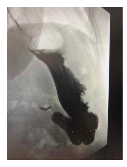
Figure 1. Contrast image of post endoscopic gastroplasty

water to ablate the duodenal mucosa circumferentially. This therapy has shown positive outcomes in management for diabetes<sup>[14,28,29]</sup>. The hypothesis behind it is that through duodenal mucosal ablation, there will re-epithelialization with normal mucosa<sup>[14]</sup>. A prospective multicenter trial showed sustained improvement of glycated hemoglobin (HbA1c) at 12 months in 37 patients with type 2 diabetes (T2D) who underwent DMR<sup>[28]</sup>. DMR has shown improvement in glycaemic control in patients with T2D; however, the mechanisms of how glycemic control is achieved are still under study.