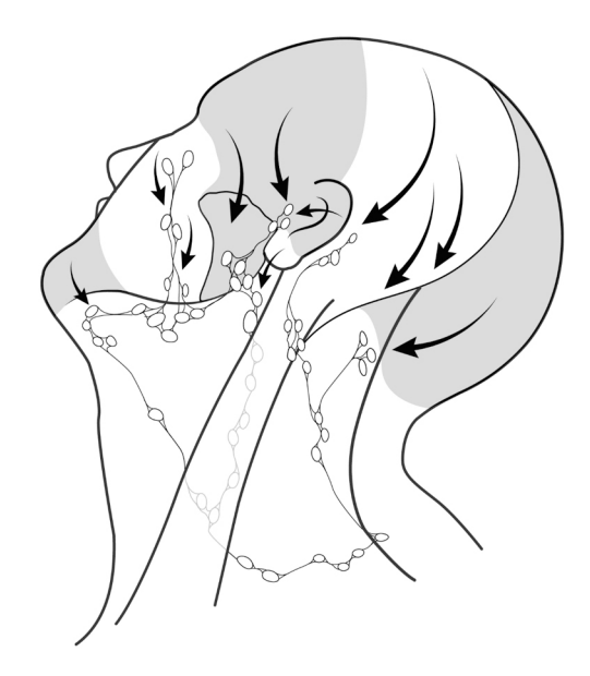
Figure 2. Patterns of metastatic spread to lateral neck lymph nodes from non-melanoma skin cancer of the head and neck.

histologic type, degree of differentiation, perineural invasion, and immunosuppression<sup>[15-18]</sup>. Immunocompromise is a significant independent risk factor for the aggressive behavior of metastatic cutaneous SCC to the neck<sup>[19,20]</sup>. Presence of disease in regional nodes from cutaneous SCC has been associated with five-year survival rates ranging from 35%-70%, depending on tumor stage, surgery, and adjuvant treatment <sup>[14,16,21-25]</sup>.