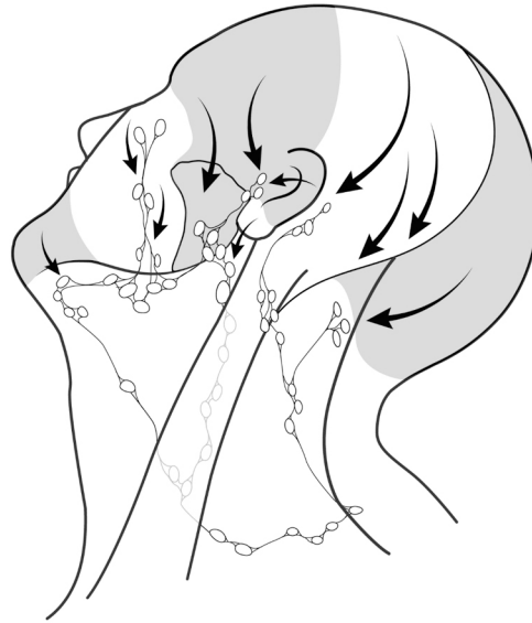
Figure 2. Patterns of metastatic spread to lateral neck lymph nodes from non-melanoma skin cancer of the head and neck.

histologic type, degree of differentiation, perineural invasion, and immunosuppression [15-18] . Immunocompromise is a significant independent risk factor for the aggressive behavior of metastatic cutaneous SCC to the neck [19,20] . Presence of disease in regional nodes from cutaneous SCC has been associated with five-year survival rates ranging from 35%-70%, depending on tumor stage, surgery, and adjuvant treatment [14,16,21-25] .