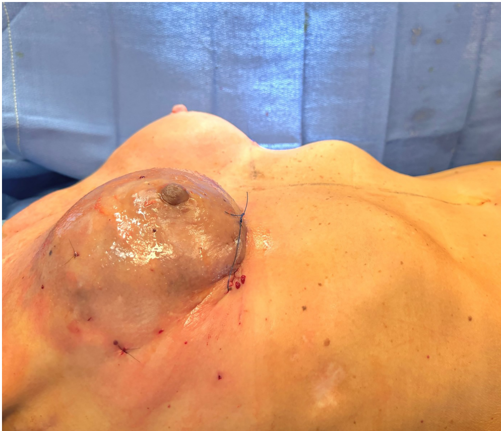
Figure 4. It is possible to apply the eventually remaining fat directly onto the skin as a biological dressing.

After the injection, the skin appears blanching above the treated area. It is recommended to slightly overcorrect the defect. Indeed, this blanching will typically resolve within a few hours as the interstitial fluid is absorbed.