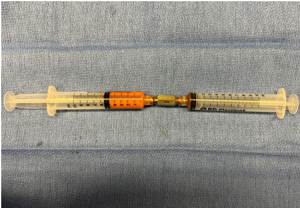
Figure 1. The emulsified fat graft; note the foamy consistency.