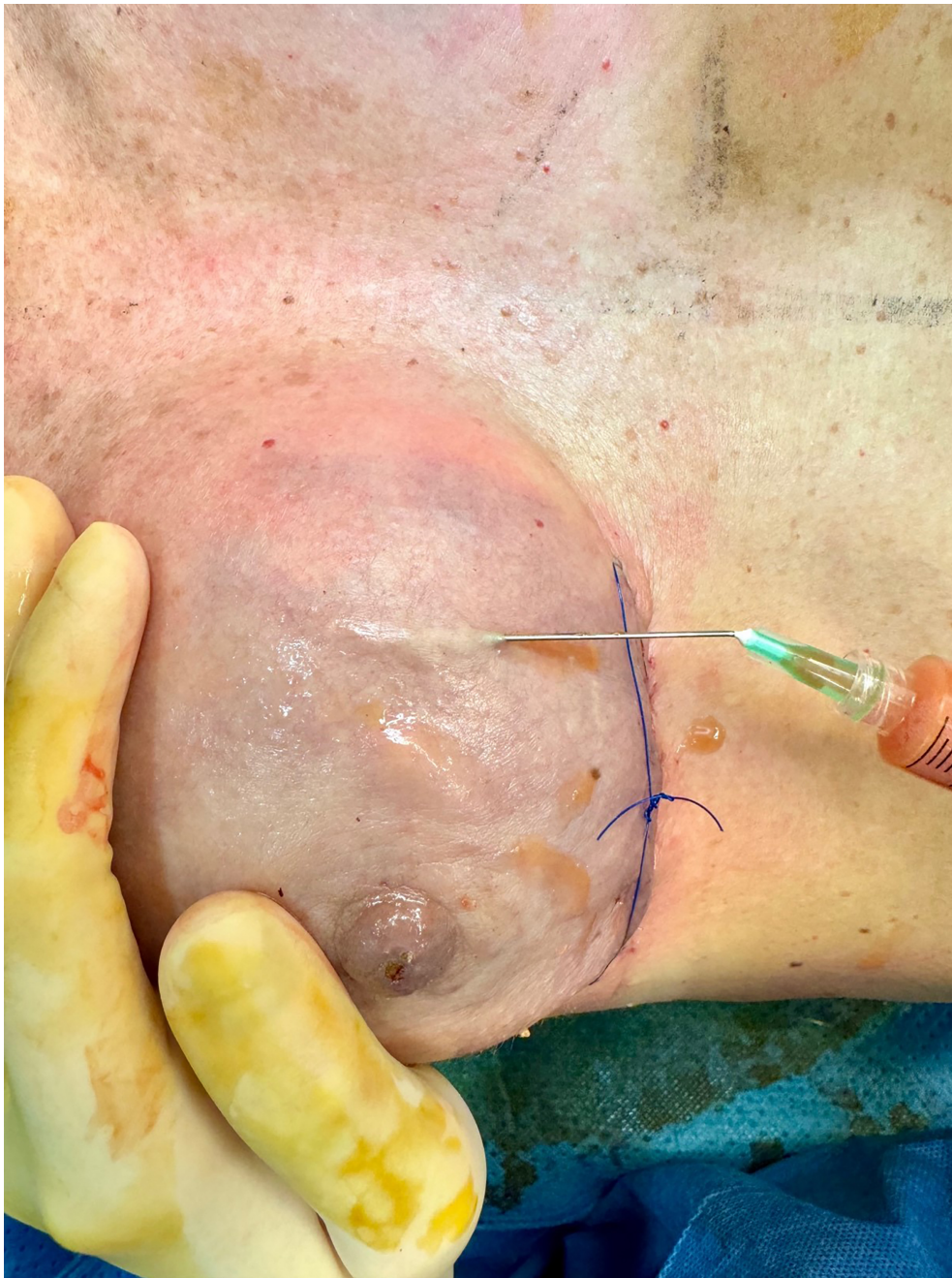
Figure 3. To facilitate fat injection, it is possible to manually adjust the orientation of the needle.

always performed after the positioning of the definitive prosthesis to determine the shape and characteristics of the breast being treated, as in common clinical practice. In our experience, the procedure is safe, and there is no risk of piercing the prosthesis if the treatment is performed correctly and is limited to the target area, specifically the dermis. Notably, to safely perform the SNIF, treatment must be directed to the very superficial skin layer, the dermis, and injections should be performed tangentially, keeping the needle parallel to the skin surface.