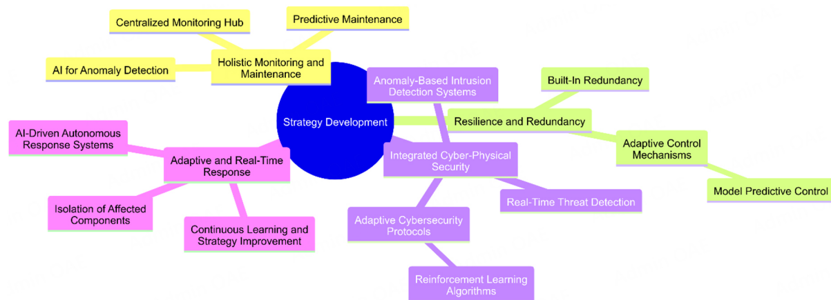
Figure 2. Strategic implications.

Such integration of AI technologies into practical operations provides novel insights that surpass current methodologies. By embedding AI into the operational fabric of transportation and logistics systems, the framework facilitates seamless, real-time decision-making, and operational adjustments, ensuring higher reliability and security across the entire logistics network. This advancement highlights the framework's potential to transform the way logistics and transportation systems are managed, offering a forward-looking approach that is both innovative and highly applicable in practice.