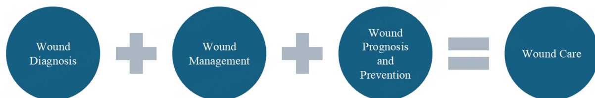
Figure 1. Schematic of the elements that comprise wound care.

AI: Artificial intelligence; SEEN-B4: Swish-ELU EfficientNet-B4.