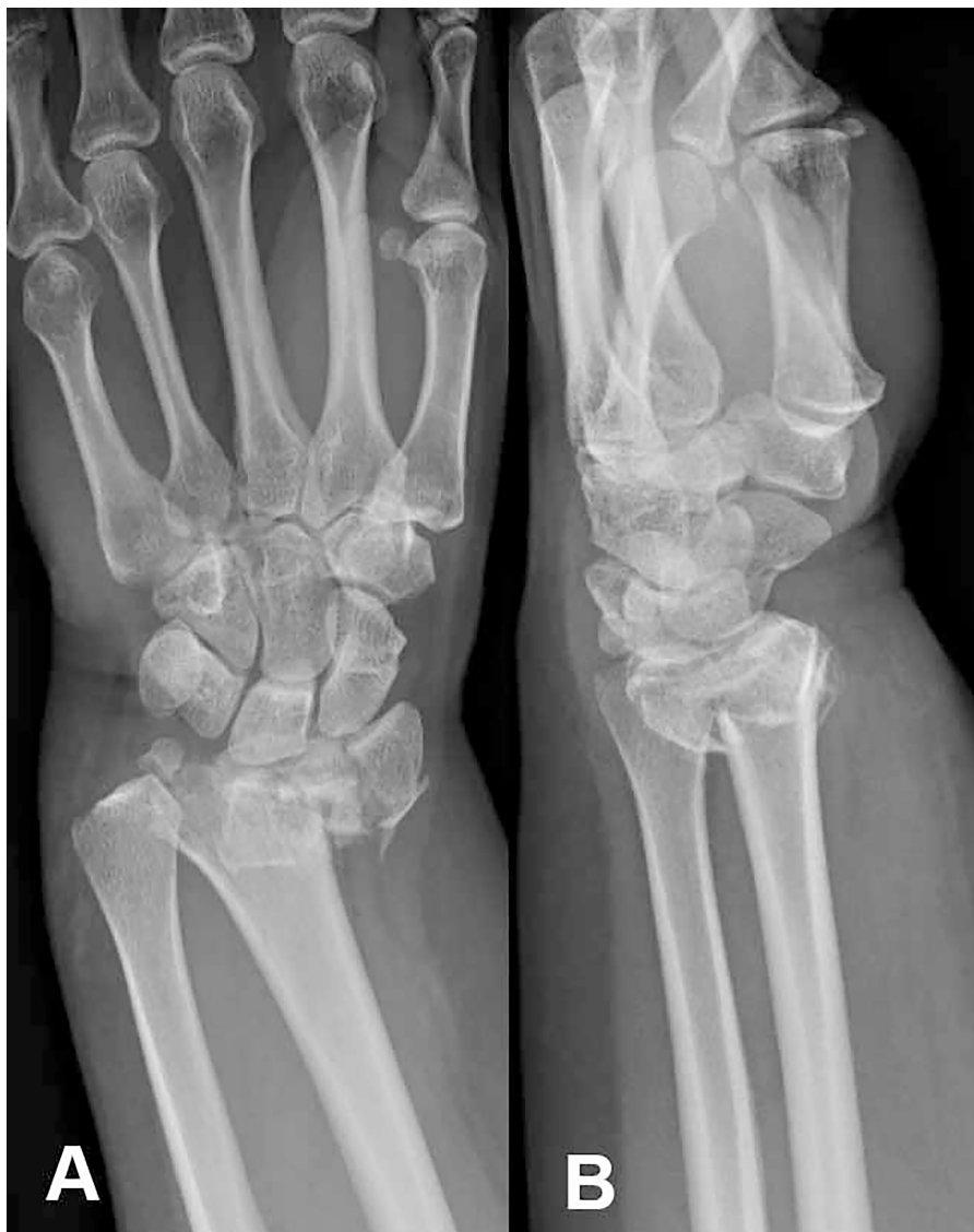
Figure 1. Posterolateral (A) and lateral radiograph (B) of a closed distal radius fracture with volar dislocation.

A 47-year-old right-handed female, with no relevant history, presented to the emergency department of another hospital after a fall from bicycle, during which she extended her left hand to break the fall. She complained of severe wrist pain and apparent deformity, in addition to experiencing a tingling sensation in her little and ring fingers. Radiographs revealed a comminuted distal radius fracture with dorsal angulation [Figure 1]. After closed reduction, her neurological symptoms worsened, and she developed complete numbness in the ulnar nerve distribution distal to the wrist. Because her wrist was immobilized with a plaster cast, her strength could not be accurately assessed. Six days after the accident, the patient was referred to our hospital, where she was seen in the outpatient clinic. She reported persisting numbness in the fourth and fifth digits and weakness in the intrinsic hand muscles [medical research council scale