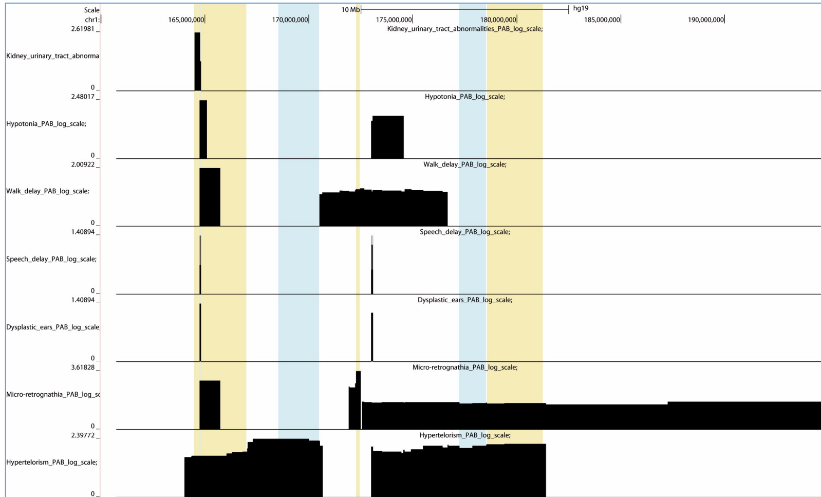
Figure S4: Overview of the SROs and probability profiling of genomic regions linked to selected traits

Legend: : The probability profile was calculated taking into account both the maximum size of the deletions determined by array-CGH analysis